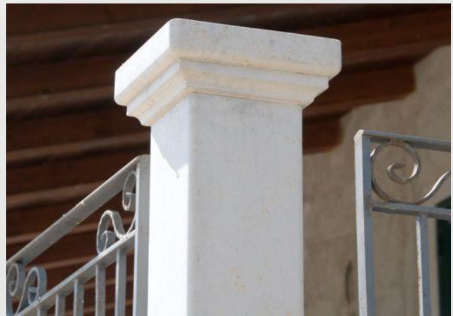
Examples of little pillars holding the railing.