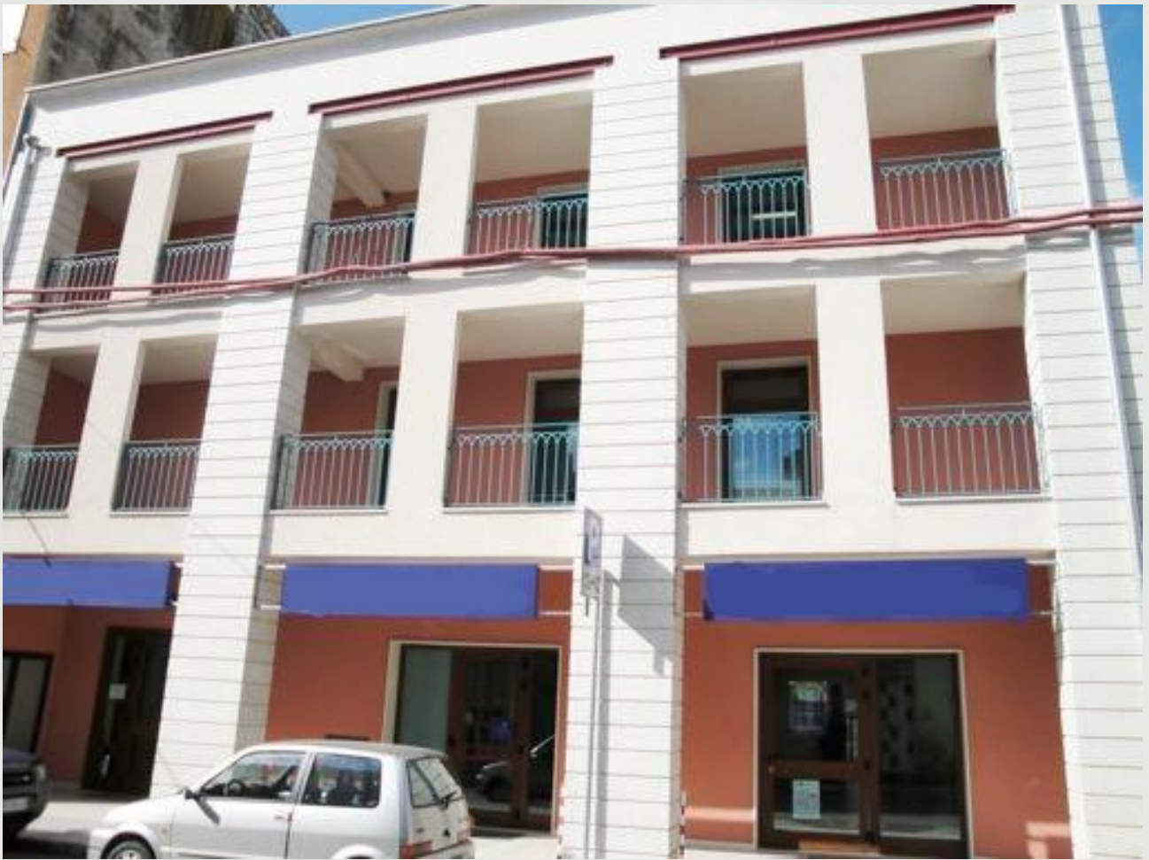
Building designed in Scicli for a banking company.