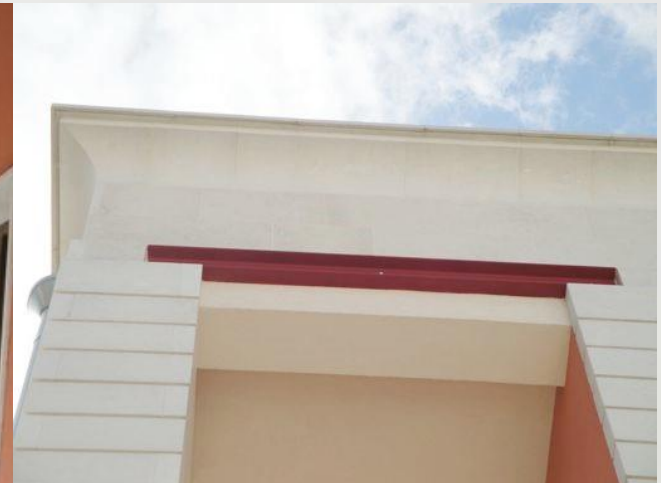
Left: pillars covered with smooth blocks where it was possible to create a shady area; the floor is made with aged slabs. Above: detail of the cornice.