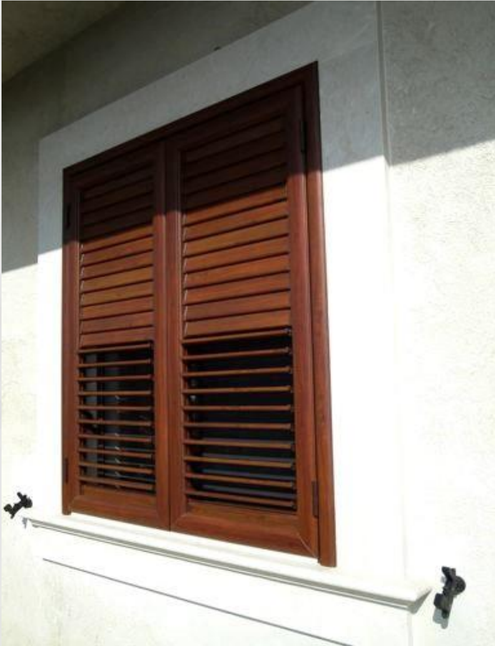
Smooth finish for window opening.