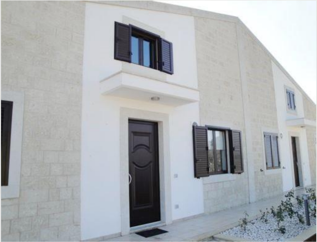
House made of stone blocks "a spacco di cava" (natural split stone)