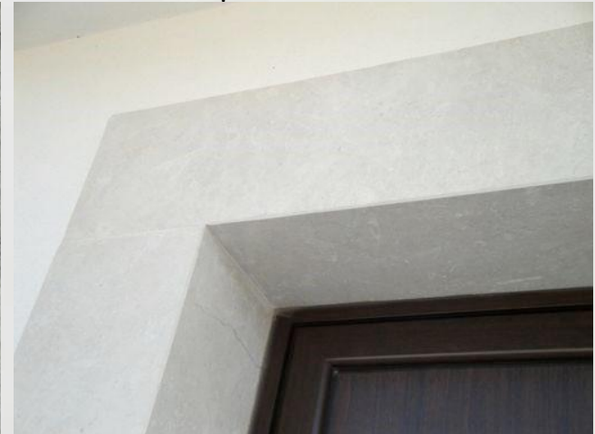
Left: detail of masonry.