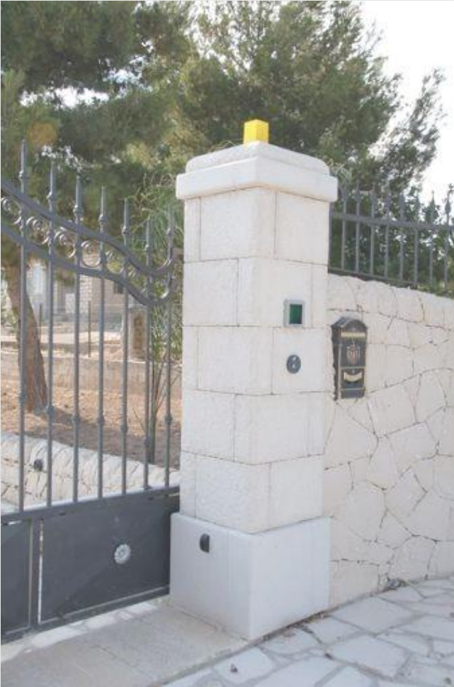
Type of pillar covering in country house style.