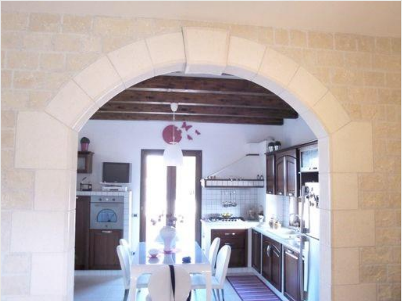
Arch creating an open space realized with massive handmade blocks; the wall has been covered with little handmade tiles "a spacco di cava" (natural split stone). Below, right: detail of the keystone.