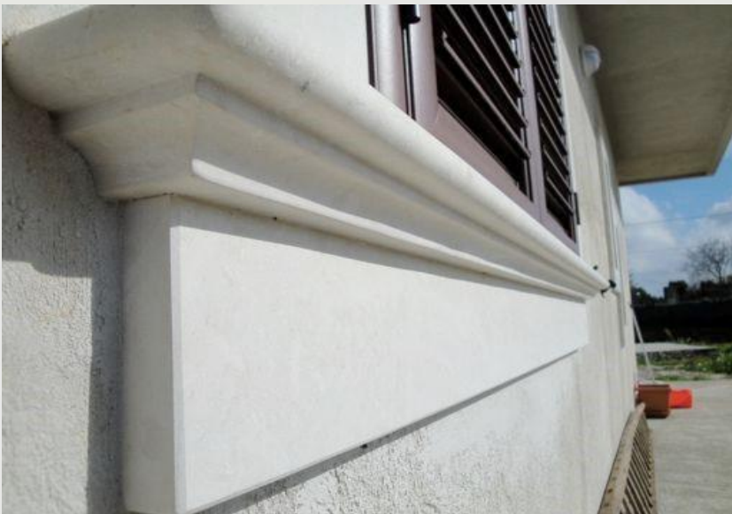
Detail of the windowsill.